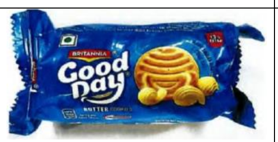
Colour combination of Blue, Yellow and White.